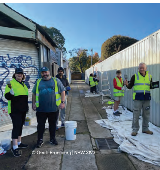
NHW 3193