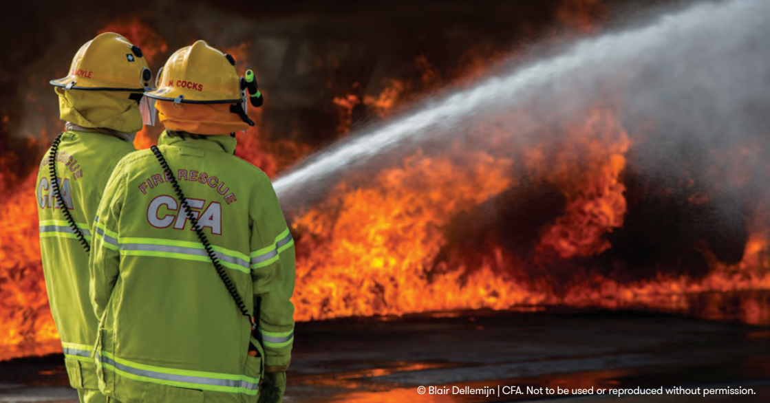
© Blair Dellelijn | CFA. Not to be used or reproduced without permission.