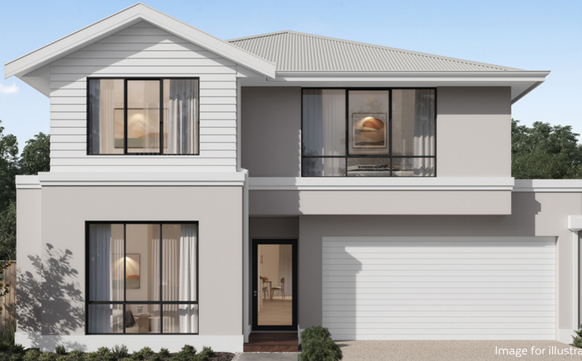
Image for illustrative purposes only