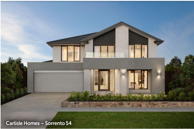
Carlisle Homes – Sorrento 54