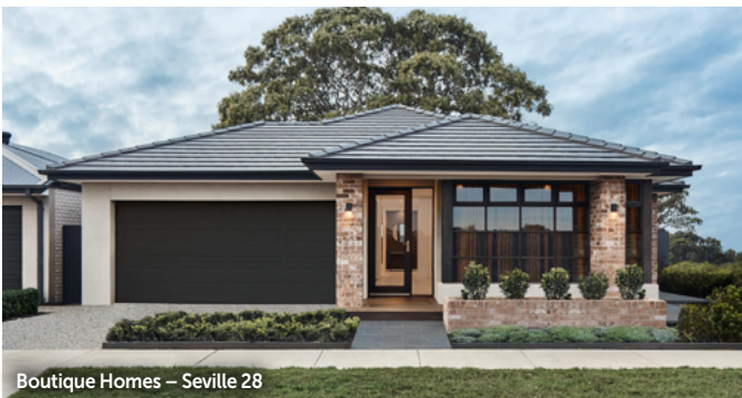
Boutique Homes – Seville 28

The four builders we've selected – Boutique Homes, Homebuyers Centre, Carlisle Homes and Mimosa Homes – are also some of our longest standing building partners.