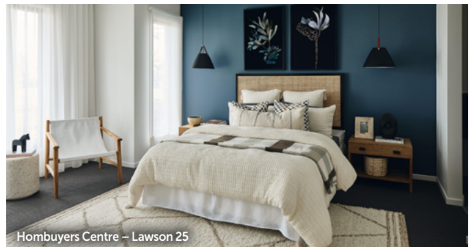
Hombuyers Centre – Lawson 25