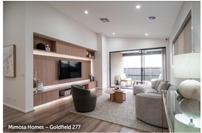
Mimosa Homes – Goldfield 277

We assess market trends to ensure our floor plans and façades are at the forefront of the homebuilding process for our clients. Partnering with land developers such as Satterley allows Carlisle clients to understand the meaning of community.