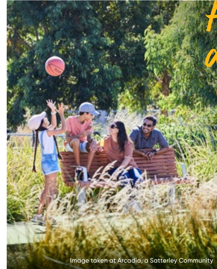
Image taken at Arcadia, a Satterley Community

Perfectly placed in the Pakenham East precinct, one of the newest areas in Melbourne's popular south-east, Maple Grove offers you a way of life that, frankly, will make your friends a little jealous.