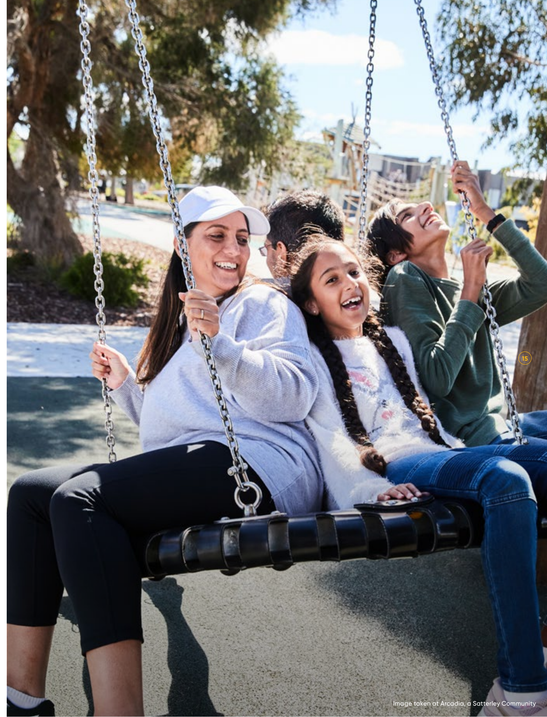
Image taken at Arcadia, a Satterley Community

And that's just what's available to you right now. Planned improvements for the local area mean a world of future convenience awaits.