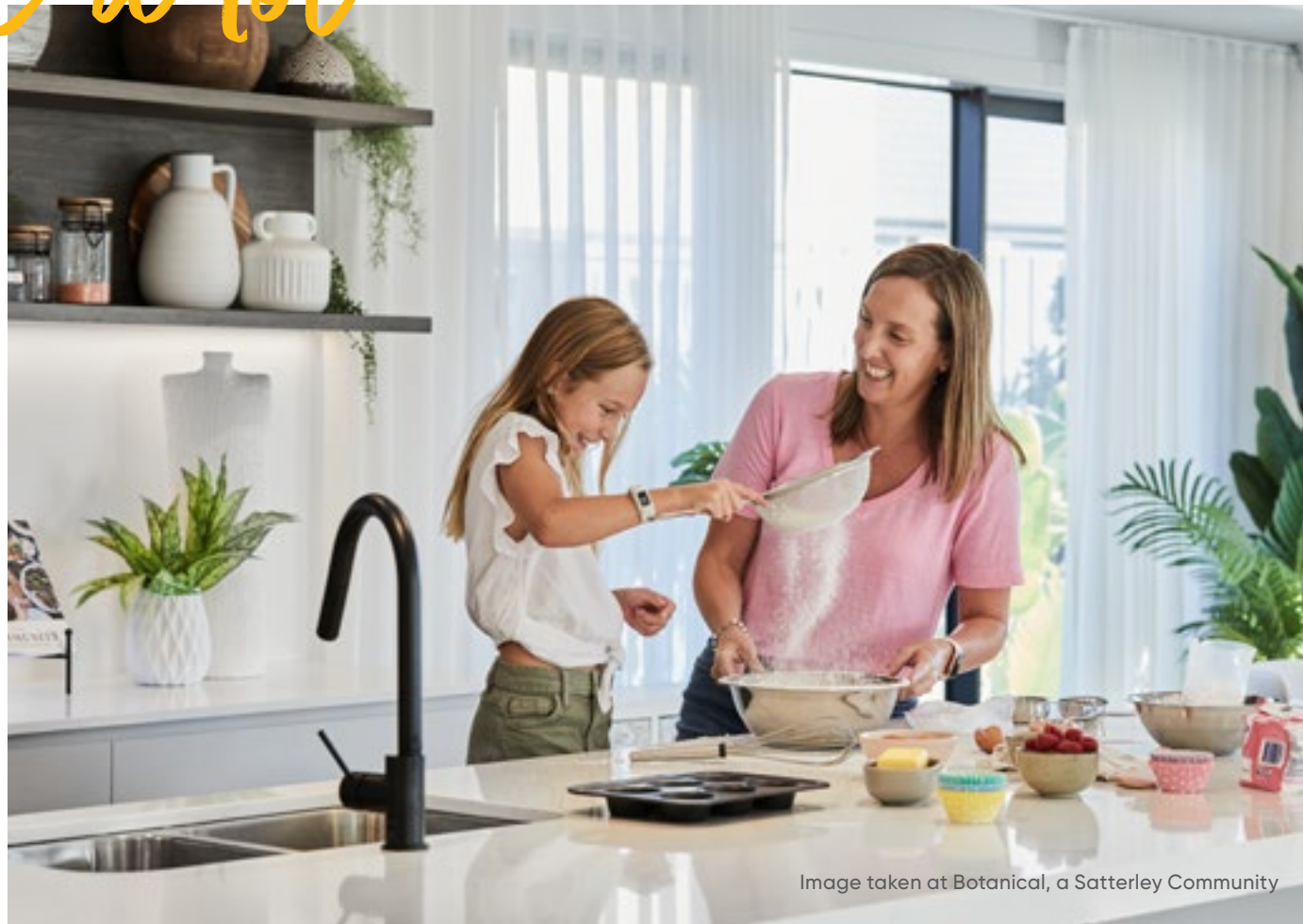
Image taken at Botanical, a Satterley Community

Maple Grove connects you with everything you need to take your way of life to the next level. Proximity to not one but several shopping centres ensures you're always perfectly poised for a midnight snack or weekend shopping spree, while a local focus on education means the region is packed with schools and childcare centres for the kids.