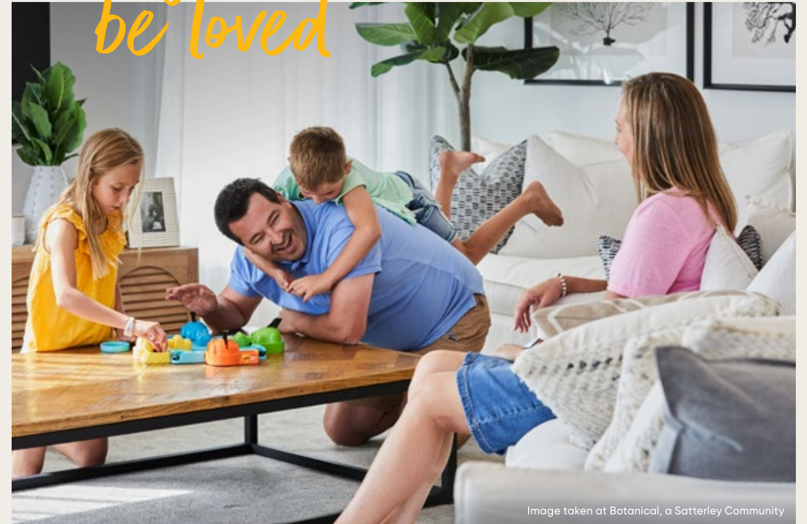
Image taken at Botanical, a Satterley Community

Located within the Pakenham East Precinct, strap yourself in for a community sports reserve and indoor recreation centre. Surrounded by 130 Hectares of lush open space to explore, a nearby town centre complete with countless stores and eateries, brand new schools, and a network of walking and cycle paths to safely connect it all.