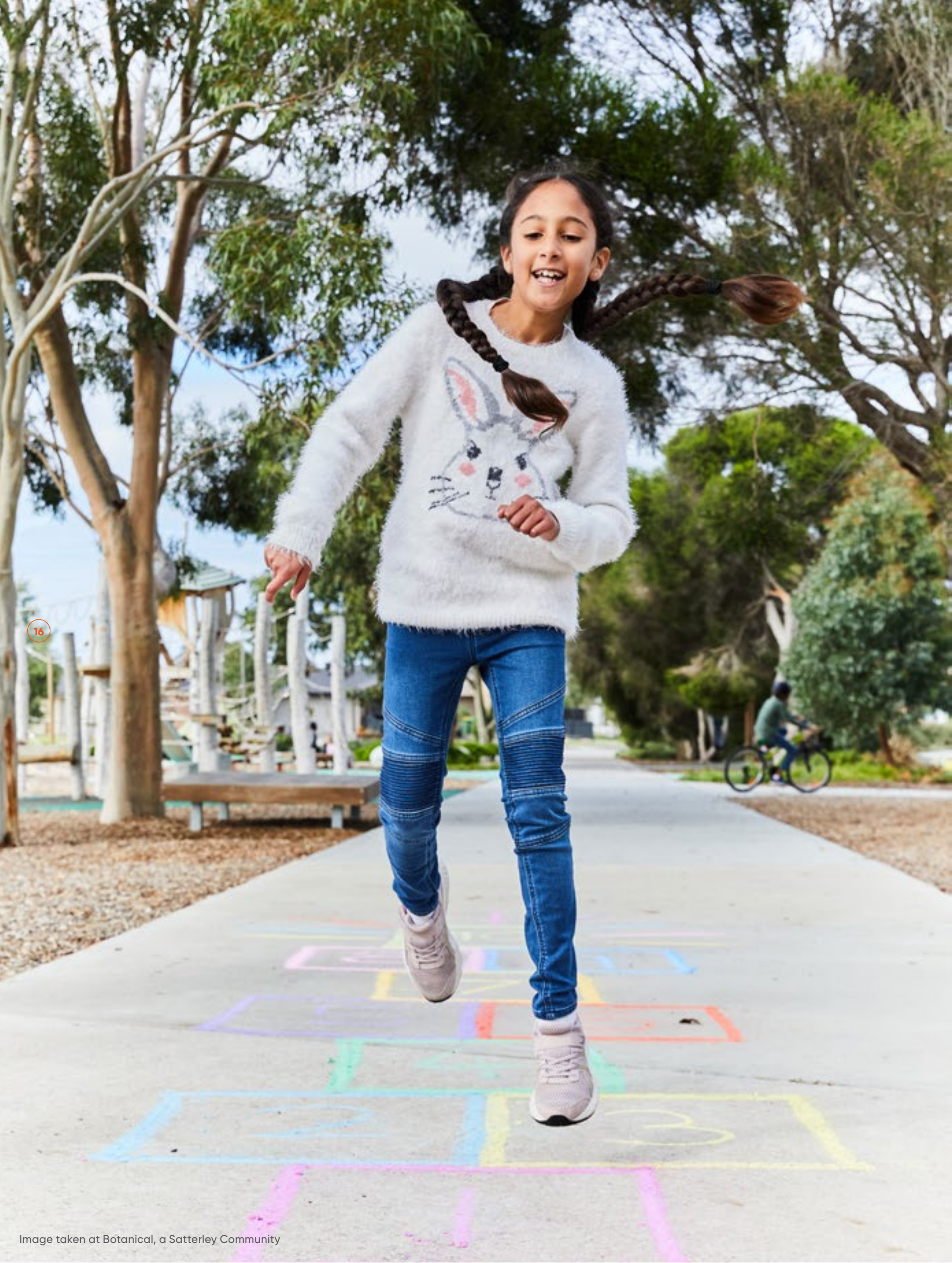
Image taken at Botanical, a Satterley Community